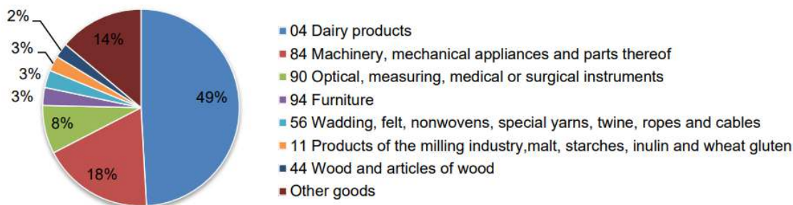
Figure 2: Structure of domestically produced exports to Indonesia in 2015, %